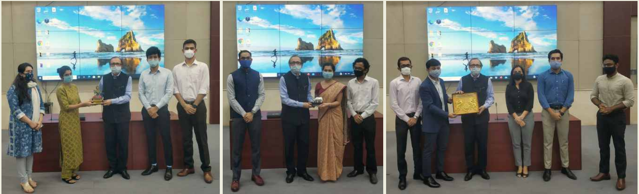
IFS OTs handover insignias to Dean (SSIFS) which were received by the respective groups during their Army Attachments