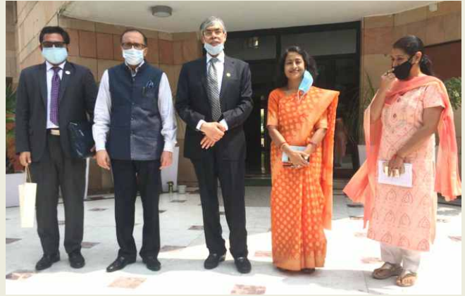
H.E. Mr. Muhammad Imran, High Commissioner of Bangladesh to India visited SSIFS to discuss bilateral issues of cooperation and training related matters.