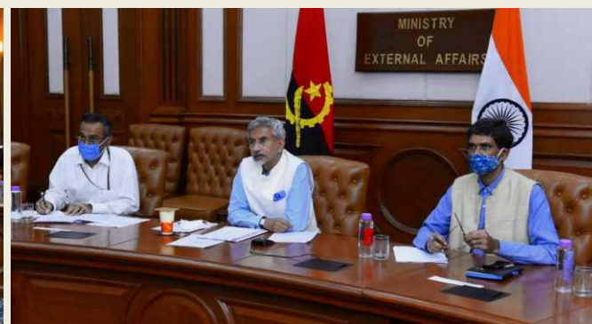
MoU with Angola signed on the margins of 1 st India-Angola Joint Commission Meeting