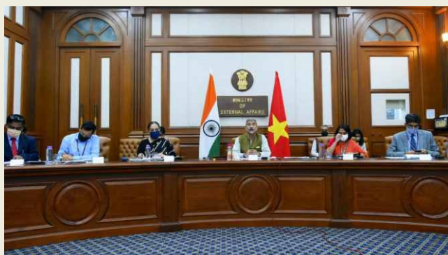
MoU with Vietnam signed on the margins of 17 th India-Vietnam Joint Commission Meeting