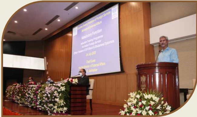
EAM addressing the IFS OTs

A valedictory ceremony was organized on 24 July 2020, which was presided over by Dr. S. Jaishankar, Hon'ble External Affairs Minister (EAM) as Chief Guest. Shri V. Muraleedharan, Hon'ble Minister of State for External Affairs (MoS) and Shri Harsh V. Shringla, Foreign Secretary participated as Guests of Honour. Awards were given on the occasion to deserving OTs of the 2019 batch.