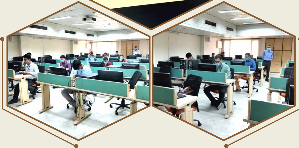
English Stenography Test for PAs & Stenos in progress