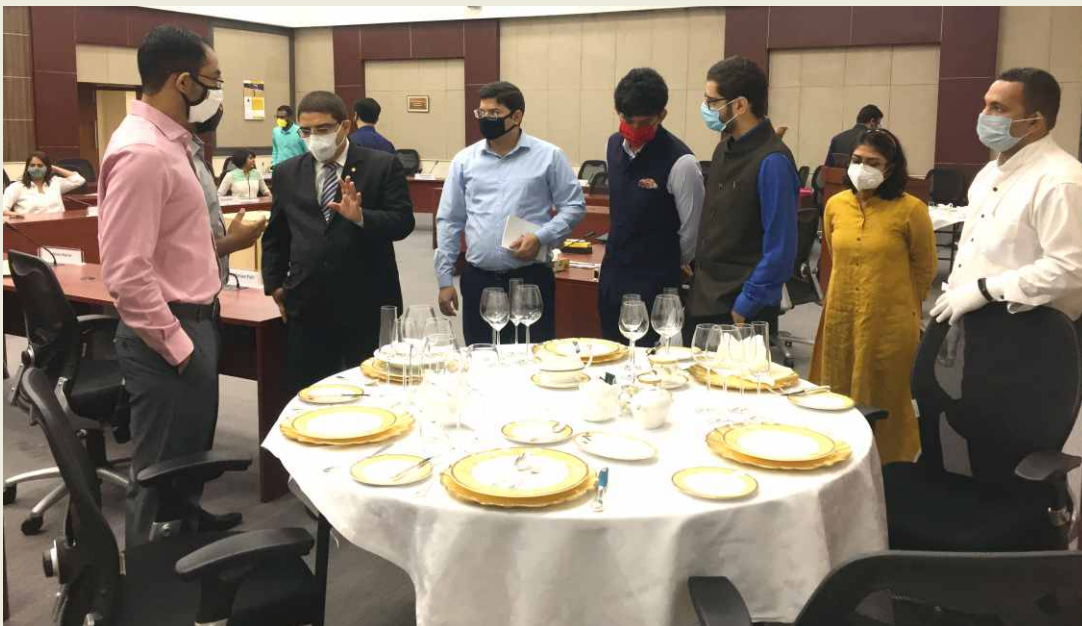
'Workshop on Hospitality' for the IFS OTs conducted at Hotel Taj Palace, New Delhi