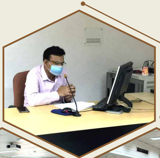
Speaker addressing on webinar to participants of the Promotion-related Training Programme