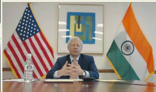
▼ H.E. Mr. Kenneth I. Juster, Ambassador of US to India interacted on webinar with the IFS OTs